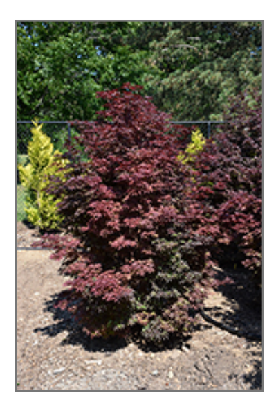
Twombly's Red Sentinel Japanese Maple