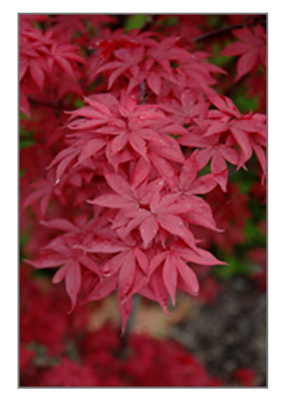
Twombly's Red Sentinel Japanese Maple foliage

Twombly's Red Sentinel Japanese Maple is recommended for the following landscape applications;