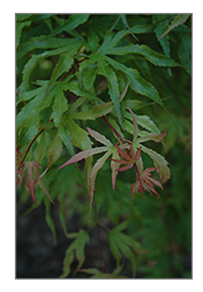
Tsuri Nishiki Japanese Maple foliage