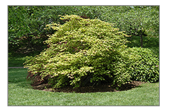
Tsuma Gaki Japanese Maple