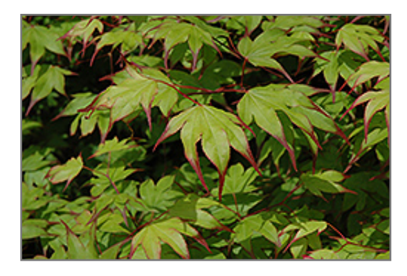
Tsuma Gaki Japanese Maple foliage

Tsuma Gaki Japanese Maple is recommended for the following landscape applications;