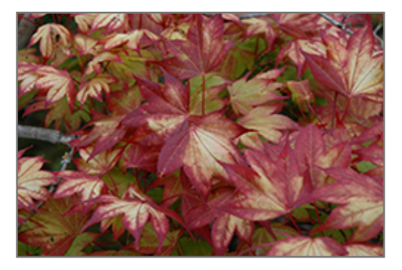
Tsuma Gaki Japanese Maple foliage

Tsuma Gaki Japanese Maple will grow to be about 10 feet tall at maturity, with a spread of 10 feet. It tends to be a little leggy, with a typical clearance of 2 feet from the ground, and is suitable for planting under power lines. It grows at a slow rate, and under ideal conditions can be expected to live for 60 years or more.