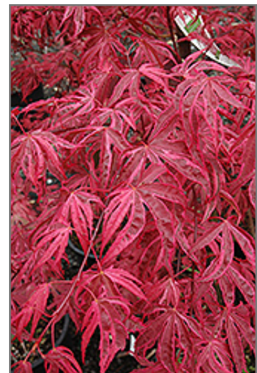
Shirazz Japanese Maple foliage