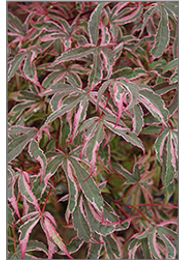
Shirazz Japanese Maple foliage