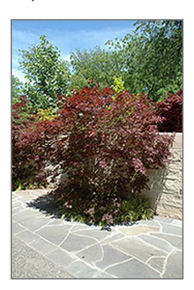
Sherwood Flame Japanese Maple

Sherwood Flame Japanese Maple is recommended for the following landscape applications;