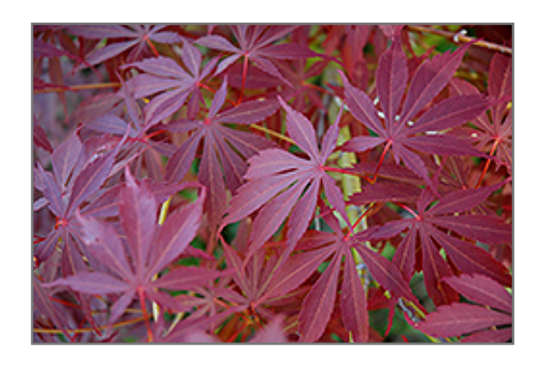
Sherwood Flame Japanese Maple foliage

This is a relatively low maintenance tree, and should only be pruned in summer after the leaves have fully developed, as it may 'bleed' sap if pruned in late winter or early spring. It has no significant negative characteristics.