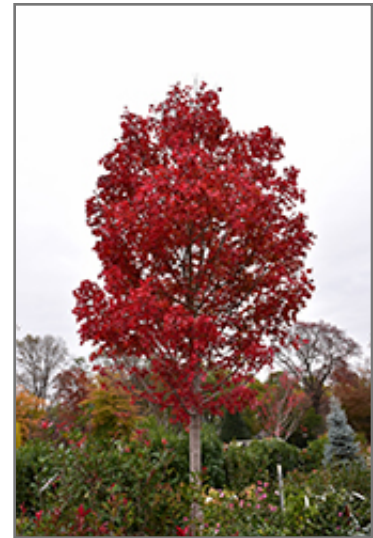
October Glory Red Maple in fall