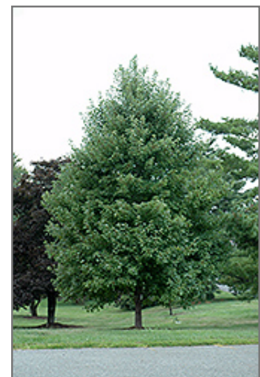
October Glory Red Maple