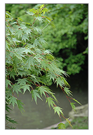
Sazanami Japanese Maple foliage

This is a relatively low maintenance tree, and should only be pruned in summer after the leaves have fully developed, as it may 'bleed' sap if pruned in late winter or early spring. It has no significant negative characteristics.