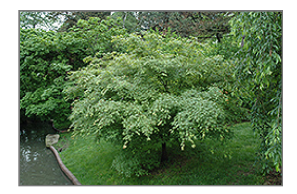
Sazanami Japanese Maple

Sazanami Japanese Maple is recommended for the following landscape applications;