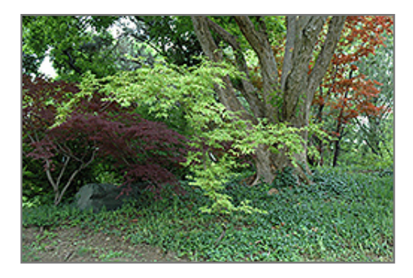
Sagara Nishiki Japanese Maple