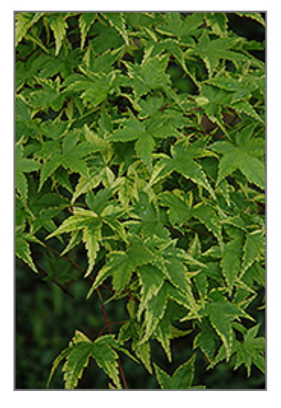
Sagara Nishiki Japanese Maple foliage

Sagara Nishiki Japanese Maple is recommended for the following landscape applications;