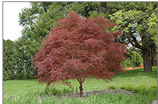
Dwarf Red Pygmy Japanese Maple