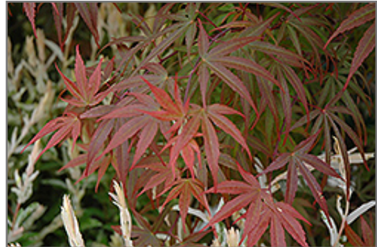
Dwarf Red Pygmy Japanese Maple foliage

Dwarf Red Pygmy Japanese Maple is recommended for the following landscape applications;