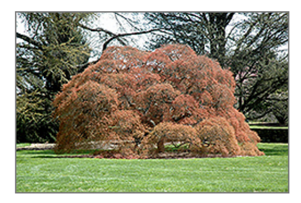
Ornatum Japanese Maple