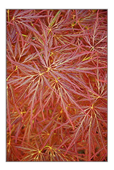
Ornatum Japanese Maple foliage

Ornatum Japanese Maple is recommended for the following landscape applications;