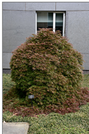
Orangeola Cutleaf Japanese Maple