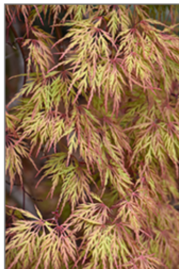
Orangeola Cutleaf Japanese Maple foliage

Orangeola Cutleaf Japanese Maple is recommended for the following landscape applications;