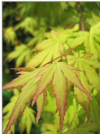
Orange Dream Japanese Maple foliage

Orange Dream Japanese Maple is recommended for the following landscape applications;