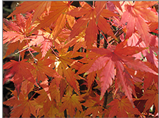
Orange Dream Japanese Maple in fall

Orange Dream Japanese Maple is a fine choice for the yard, but it is also a good selection for planting in outdoor pots and containers. Its large size and upright habit of growth lend it for use as a solitary accent, or in a composition surrounded by smaller plants around the base and those that spill over the edges. It is even sizeable enough that it can be grown alone in a suitable container. Note that when grown in a container, it may not perform exactly as indicated on the tag - this is to be expected. Also note that when growing plants in outdoor containers and baskets, they may require more frequent waterings than they would in the yard or garden. Be aware that in our climate, most plants cannot be expected to survive the winter if left in containers outdoors, and this plant is no exception. Contact our experts for more information on how to protect it over the winter months.