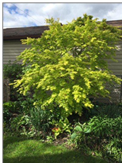
Orange Dream Japanese Maple