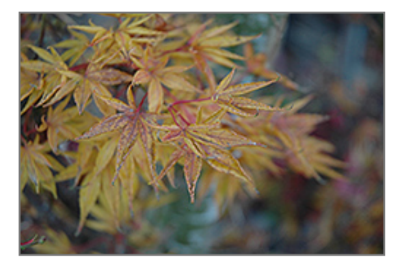
Okushimo Japanese Maple in fall

Okushimo Japanese Maple will grow to be about 20 feet tall at maturity, with a spread of 20 feet. It has a low canopy with a typical clearance of 2 feet from the ground, and is suitable for planting under power lines. It grows at a medium rate, and under ideal conditions can be expected to live for 80 years or more.