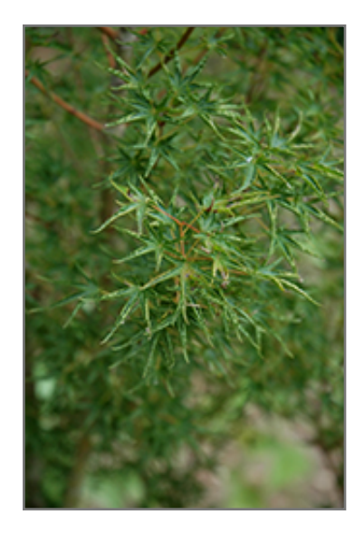
Okushimo Japanese Maple foliage

This is a relatively low maintenance tree, and should only be pruned in summer after the leaves have fully developed, as it may 'bleed' sap if pruned in late winter or early spring. It has no significant negative characteristics.