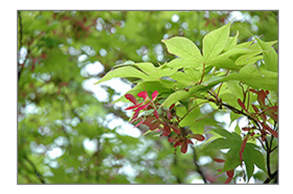
Okushimo Japanese Maple fruit