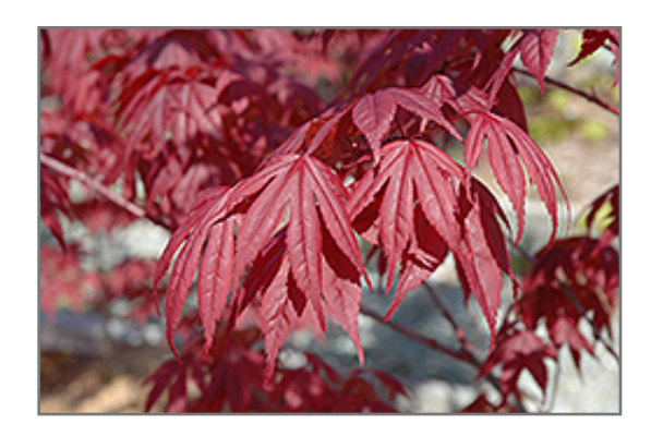
Nuresagi Japanese Maple foliage

Nuresagi Japanese Maple is recommended for the following landscape applications;