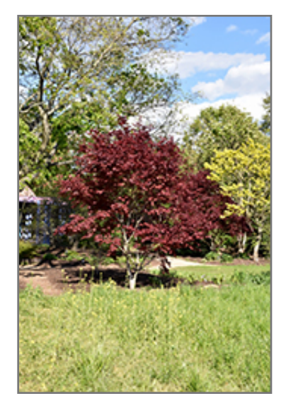
Nuresagi Japanese Maple

This is a relatively low maintenance tree, and should only be pruned in summer after the leaves have fully developed, as it may 'bleed' sap if pruned in late winter or early spring. It has no significant negative characteristics.