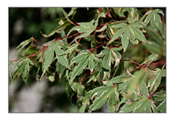
Kagiri Nishiki Japanese Maple foliage