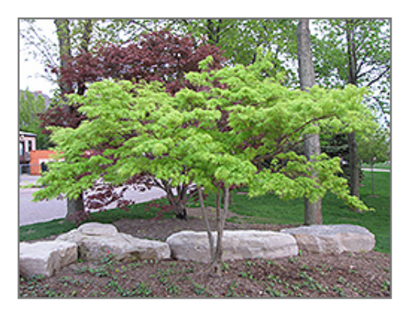
Kagiri Nishiki Japanese Maple