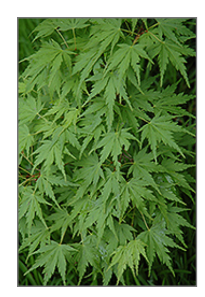
Fall's Fire Japanese Maple foliage

This is a relatively low maintenance tree, and should only be pruned in summer after the leaves have fully developed, as it may 'bleed' sap if pruned in late winter or early spring. It has no significant negative characteristics.