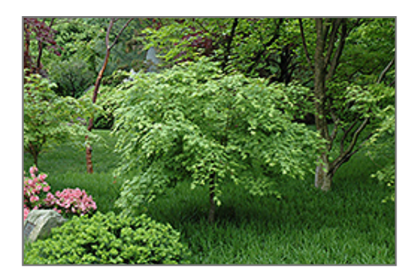
Fall's Fire Japanese Maple

Fall's Fire Japanese Maple is recommended for the following landscape applications;