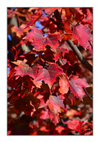
Autumn Flame Red Maple in fall