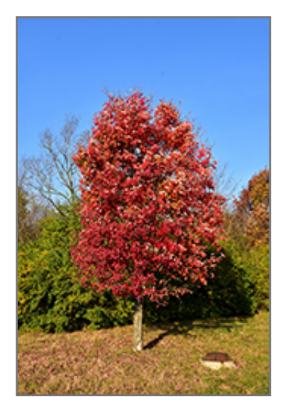
Autumn Flame Red Maple in fall

Autumn Flame Red Maple is recommended for the following landscape applications;