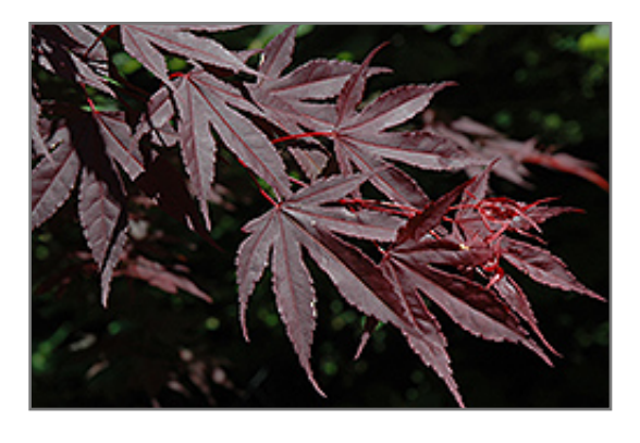
Crimson Prince Japanese Maple foliage

Crimson Prince Japanese Maple is a dense deciduous tree with an upright spreading habit of growth. Its relatively fine texture sets it apart from other landscape plants with less refined foliage.