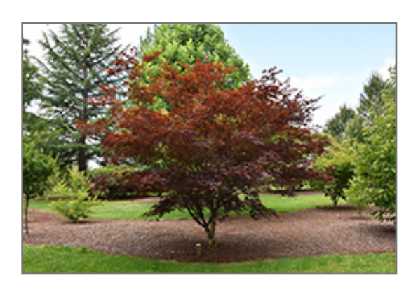
Crimson Prince Japanese Maple

This is a relatively low maintenance tree, and should only be pruned in summer after the leaves have fully developed, as it may 'bleed' sap if pruned in late winter or early spring. It has no significant negative characteristics.