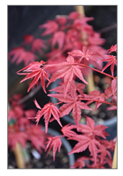
Bonfire Japanese Maple foliage

Bonfire Japanese Maple is a deciduous tree with a strong central leader and a more or less rounded form. Its relatively fine texture sets it apart from other landscape plants with less refined foliage.