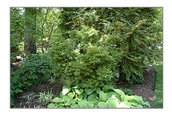
Bonfire Japanese Maple

This is a relatively low maintenance tree, and should only be pruned in summer after the leaves have fully developed, as it may 'bleed' sap if pruned in late winter or early spring. It has no significant negative characteristics.