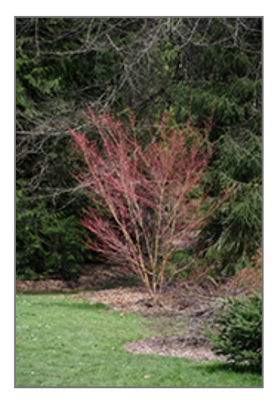
Beni Kawa Coral Bark Japanese Maple in winter

This tree does best in full sun to partial shade. You may want to keep it away from hot, dry locations that receive direct afternoon sun or which get reflected sunlight, such as against the south side of a white wall. It prefers to grow in average to moist conditions, and shouldn't be allowed to dry out. It is not particular as to soil pH, but grows best in rich soils. It is somewhat tolerant of urban pollution, and will benefit from being planted in a relatively sheltered location. Consider applying a thick mulch around the root zone in winter to protect it in exposed locations or colder microclimates. This is a selected variety of a species not originally from North America.