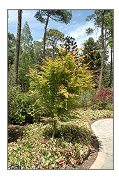
Beni Kawa Coral Bark Japanese Maple