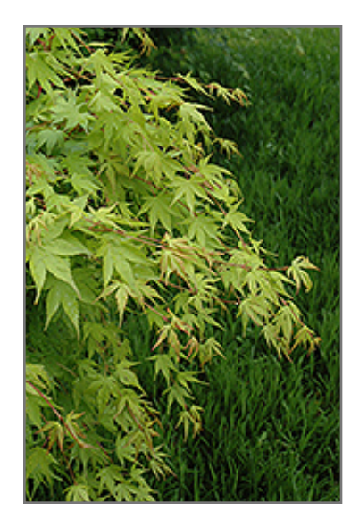
Beni Kawa Coral Bark Japanese Maple foliage