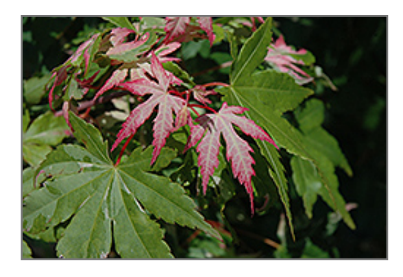
Asahi Zuru Japanese Maple foliage