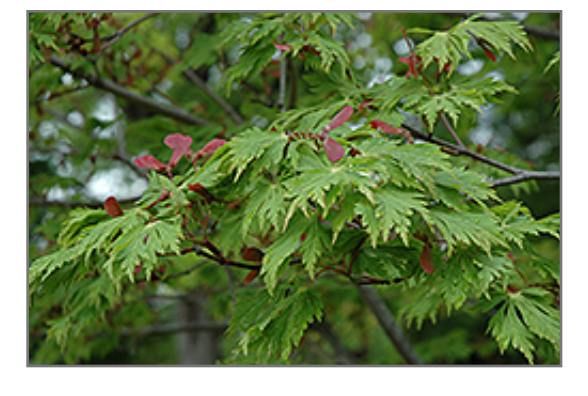
Maiku Jaku Fernleaf Full Moon Maple foliage

Maiku Jaku Fernleaf Full Moon Maple is an open multi-stemmed deciduous tree with a more or less rounded form. It lends an extremely fine and delicate texture to the landscape composition which can make it a great accent feature on this basis alone.