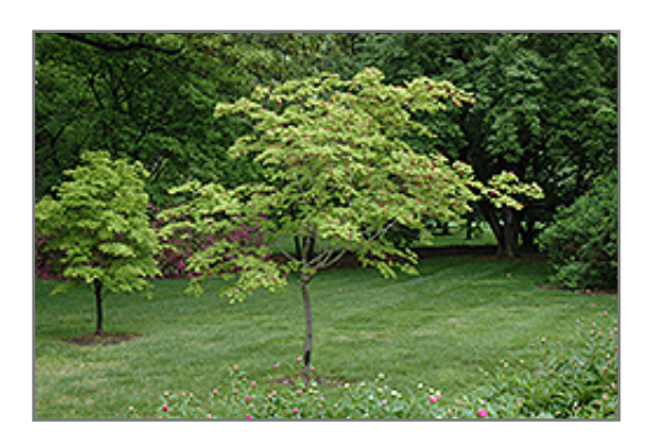
Maiku Jaku Fernleaf Full Moon Maple

This tree will require occasional maintenance and upkeep, and should only be pruned in summer after the leaves have fully developed, as it may 'bleed' sap if pruned in late winter or early spring. It has no significant negative characteristics.