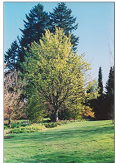
Tricolor Sycamore Maple