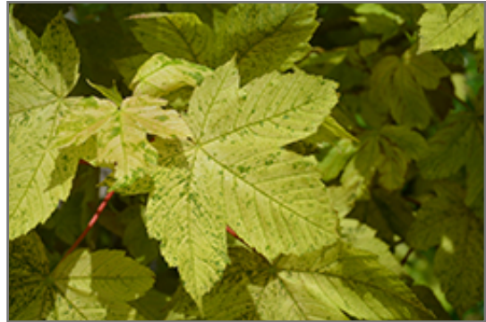
Tricolor Sycamore Maple foliage