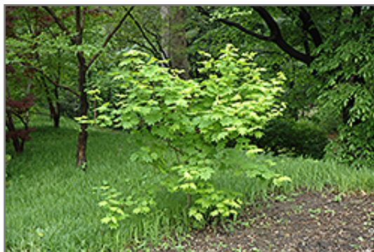
Vine Maple