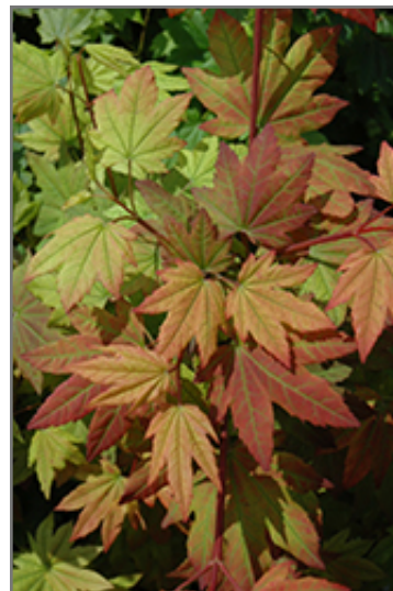
Vine Maple foliage