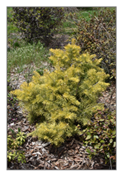
Winter Gold White Fir