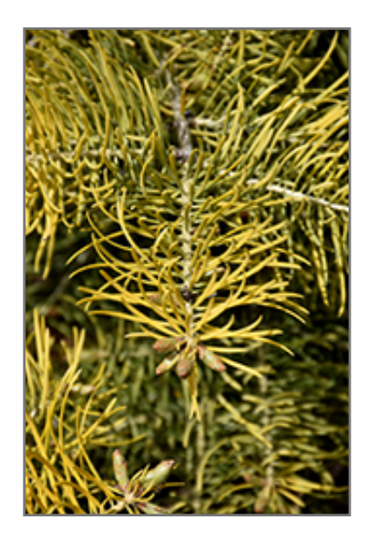
Winter Gold White Fir foliage