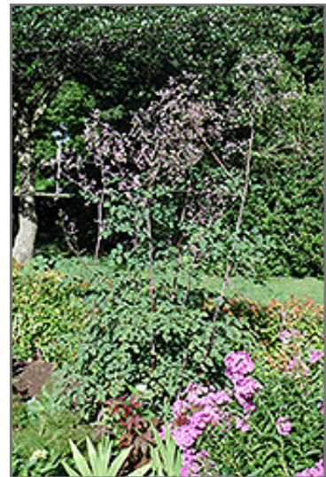
Rochebrun Meadow Rue in bloom