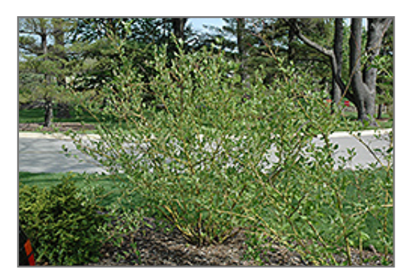
Winter Flame Dogwood in spring

Winter Flame Dogwood will grow to be about 5 feet tall at maturity, with a spread of 5 feet. It tends to fill out right to the ground and therefore doesn't necessarily require facer plants in front, and is suitable for planting under power lines. It grows at a medium rate, and under ideal conditions can be expected to live for approximately 20 years.