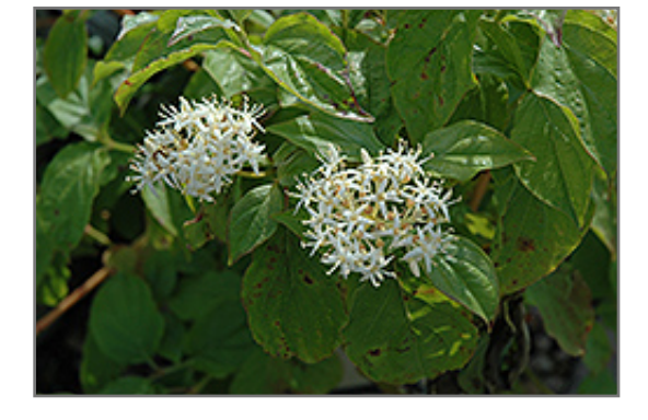
Winter Flame Dogwood flowers

This shrub will require occasional maintenance and upkeep, and is best pruned in late winter once the threat of extreme cold has passed. It is a good choice for attracting birds to your yard. Gardeners should be aware of the following characteristic(s) that may warrant special consideration;