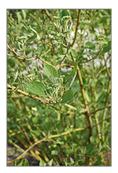
Winter Flame Dogwood foliage