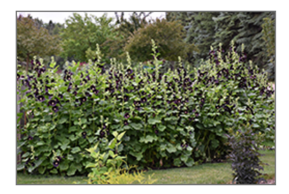
Black Hollyhock in bloom