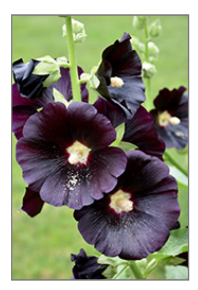
Black Hollyhock flowers

Black Hollyhock is an herbaceous perennial with a rigidly upright and towering form. Its relatively coarse texture can be used to stand it apart from other garden plants with finer foliage.