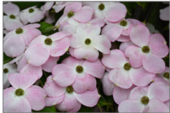
Stellar Pink Flowering Dogwood flowers

Stellar Pink Flowering Dogwood is a multi-stemmed deciduous tree with a stunning habit of growth which features almost oriental horizontally-tiered branches. Its average texture blends into the landscape, but can be balanced by one or two finer or coarser trees or shrubs for an effective composition.