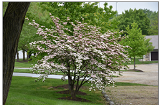
Stellar Pink Flowering Dogwood in bloom