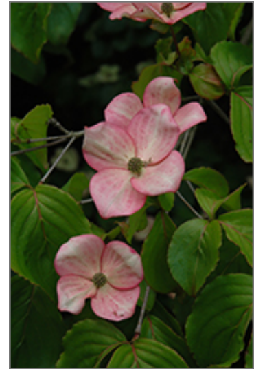
Stellar Pink Flowering Dogwood flowers

This tree does best in full sun to partial shade. It does best in average to evenly moist conditions, but will not tolerate standing water. It is very fussy about its soil conditions and must have rich, acidic soils to ensure success, and is subject to chlorosis (yellowing) of the foliage in alkaline soils. It is somewhat tolerant of urban pollution, and will benefit from being planted in a relatively sheltered location. Consider applying a thick mulch around the root zone in winter to protect it in exposed locations or colder microclimates. This particular variety is an interspecific hybrid.