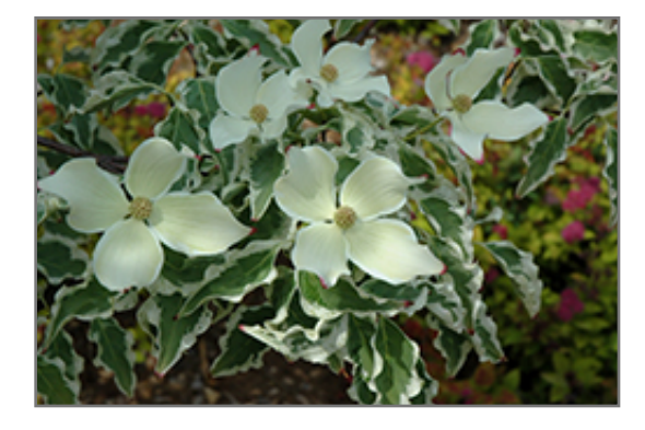
Wolf Eyes Chinese Dogwood flowers