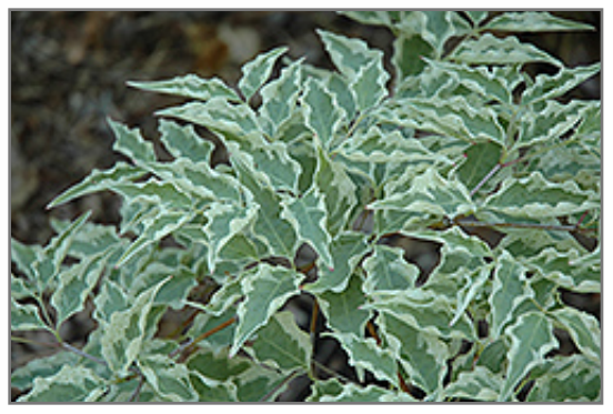
Wolf Eyes Chinese Dogwood foliage

Wolf Eyes Chinese Dogwood is a multi-stemmed deciduous tree with a stunning habit of growth which features almost oriental horizontally-tiered branches. Its average texture blends into the landscape, but can be balanced by one or two finer or coarser trees or shrubs for an effective composition.