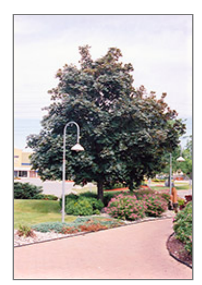
Deborah Norway Maple