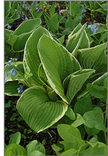
Red Alert Hosta foliage