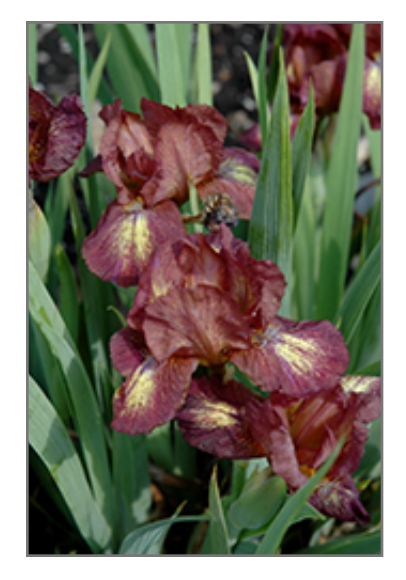
Be Little Iris flowers

Be Little Iris has masses of beautiful purple flag-like flowers with yellow throats and white streaks at the ends of the stems in mid spring, which are most effective when planted in groupings. The flowers are excellent for cutting. Its sword-like leaves remain green in colour throughout the season.