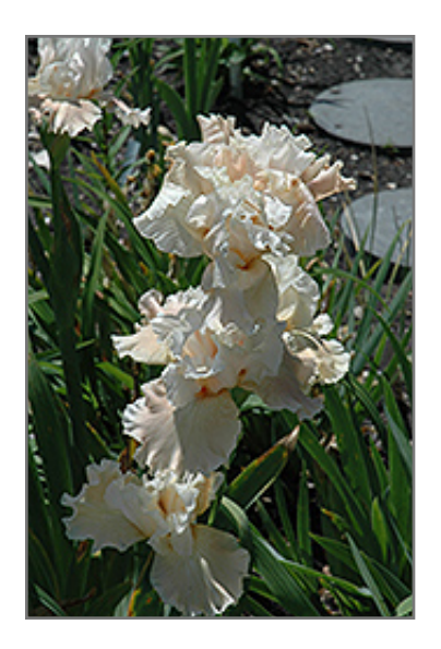
Eramosa Miss Iris flowers