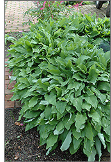
White-Flowered Siebold's Hosta

Mounds of large, textured, blue-green heart shaped foliage create the perfect background for shaded garden beds; delicate white flowers appear on arching scapes during the mid summer; adds texture and contrast; low maintenance and easy to grow