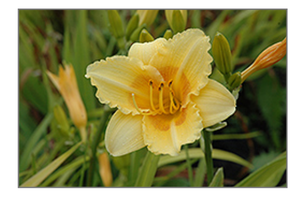
Thebuletta Daylily flowers