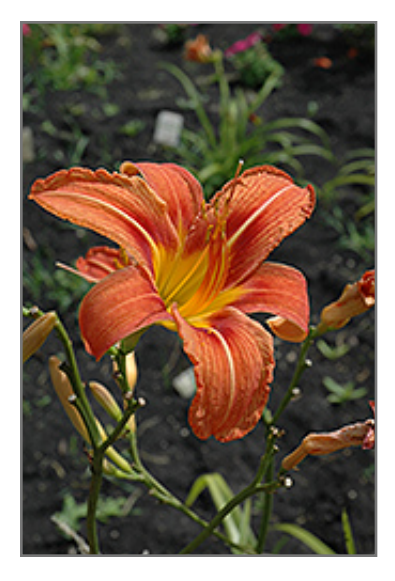
Bender's Heritage Daylily flowers

Bold and vibrant orange blooms with yellow throats and white stripes; strong and sturdy stems rise above low mounds of arching green foliage; blooms early to mid summer, great for perennial borders and beds; low maintenance, good for any gardener