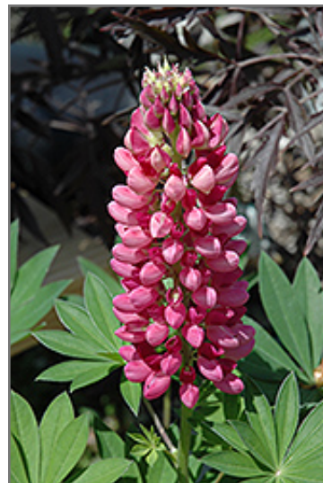
Gallery Red Lupine flowers