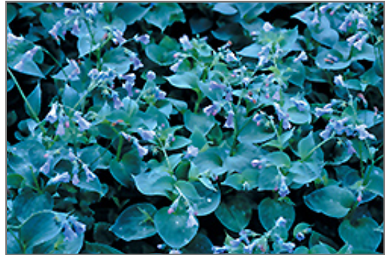
Siberian Bluebells flowers