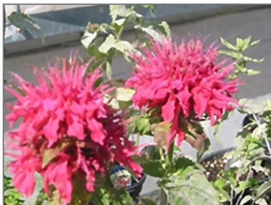
Pink Supreme Beebalm flowers

Pink Supreme Beebalm is recommended for the following landscape applications;