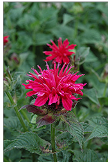
Fireball Beebalm flowers