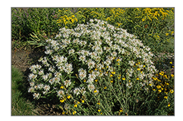
Snow White Beebalm in bloom