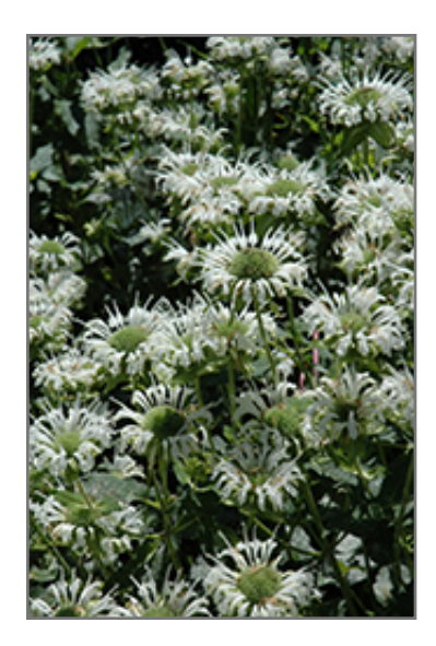
Snow White Beebalm flowers

Snow White Beebalm is an herbaceous perennial with an upright spreading habit of growth. Its relatively coarse texture can be used to stand it apart from other garden plants with finer foliage.