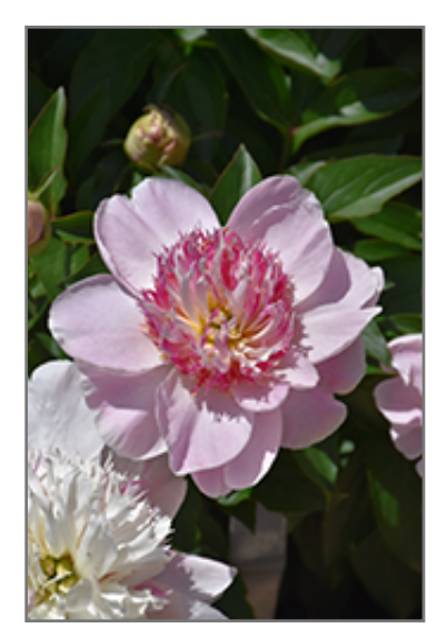
Do Tell Peony flowers

This is a relatively low maintenance plant, and should be cut back in late fall in preparation for winter. Deer don't particularly care for this plant and will usually leave it alone in favor of tastier treats. Gardeners should be aware of the following characteristic(s) that may warrant special consideration;