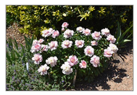
Do Tell Peony in bloom