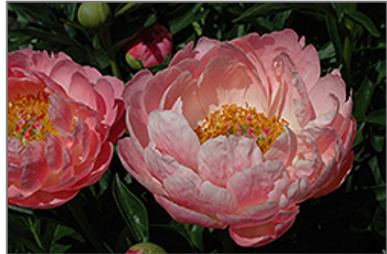
Coral n' Gold Peony flowers