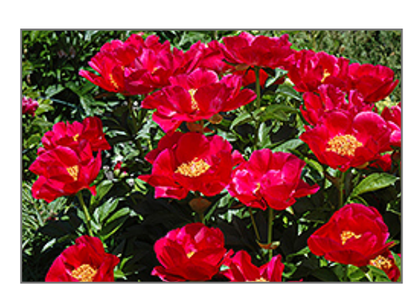
Blaze Peony flowers

A nearly-single or anemone peony with an intense red color, flowers are bold and beautiful; flowers of this variety are not likely to collapse in the first hard rain; deadhead after flowers fade