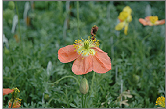
Alpine Poppy flowers