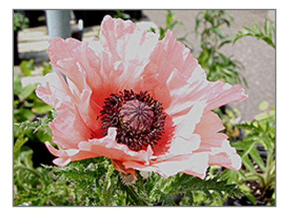
Clochard Poppy flowers