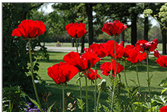
Beauty of Livermere Poppy flowers