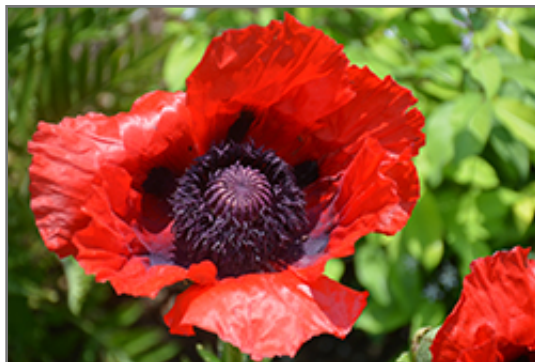
Beauty of Livermere Poppy flowers

Beauty of Livermere Poppy is recommended for the following landscape applications;