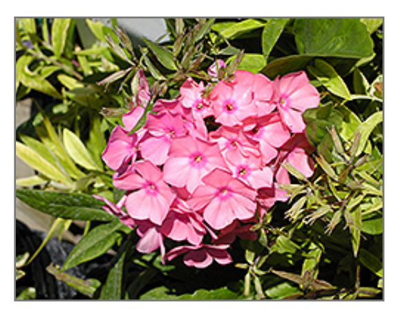
Bill Baker Phlox flowers