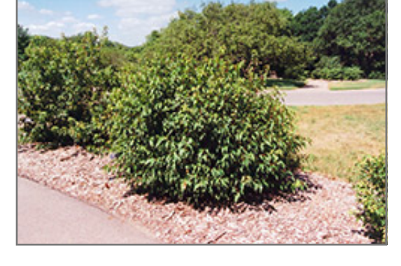
Bailey Compact Amur Maple

A compact version of the popular species with a dense, tight growth habit and excellent fall colors; ideal for garden or accent use, makes a fantastic hedge